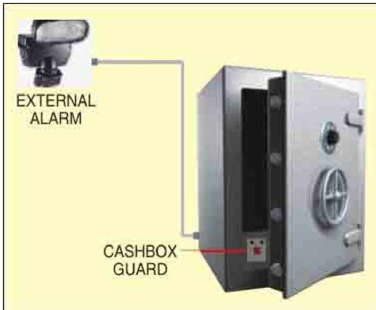
Fig. 3: Unit fitted inside the cash box & also connected to an external alarm